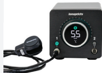
IonOpticks HeatSync™ Heater and Controller