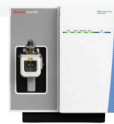
Thermo Scientific TSQ Quantis MS