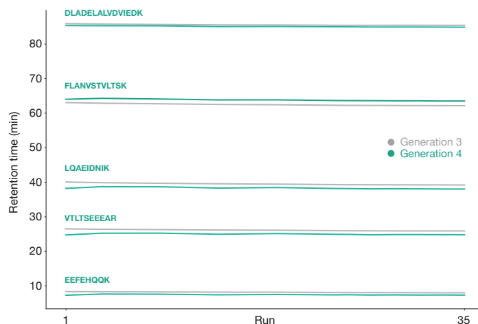
Figure 2: Retention time stability comparison between Generation 3 and Generation 4 Aurora® Ultimate™ 25 cm × 75 μm columns.